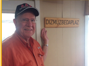
THIS MUST BE THE PLACE!

A Happy Thanksgiving and a Merry Christmas Everyone