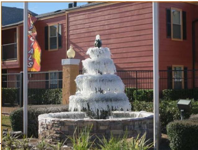
Yes, this is Houston. Brrr. Really!

Our deep appreciation to each and all of you who pray for us. Everywhere we go people tell us that they keep us before the Lord in prayer. I assure you that is a marvelous gift