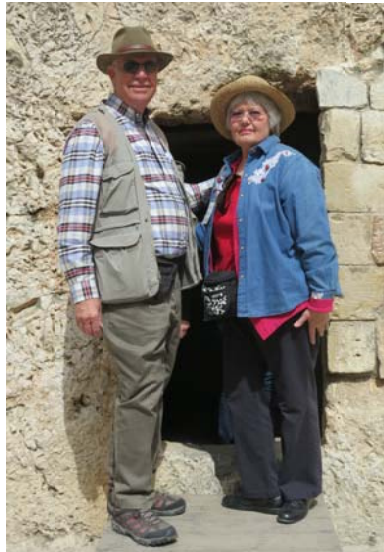
The Garden Tomb in 2013

And so it is with life. What we see when watching others depends on the purity of the window through which we look!