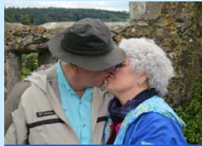
I didn't kiss the Blamey Stone; I did a whole lot better!

still are, but even more! Yes! Over the years our love has grown far deeper & richer! Knowing what we know now, would we do it again? Yes, yes, yes! Without hesitation! She is so beautiful both inside & out. Next to my salvation, she's God's greatest gift to me.